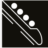
IBSF Bobsleigh Skeleton