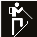
ISMF Ski Mountaineering