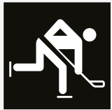
IIHF Ice Hockey